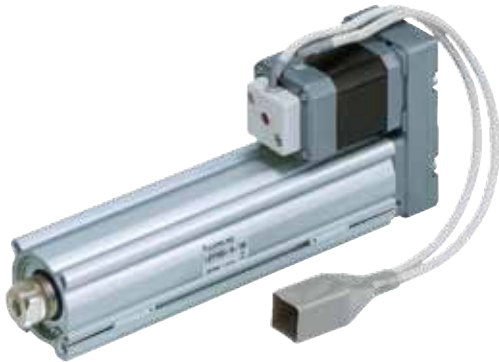
Elektrischer Zylinder/ mit Führungsstange Serie LEffY