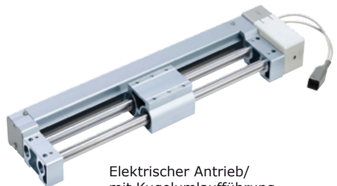
Elektrischer Antrieb/ mit Kugelumlaufführung Serie LEL