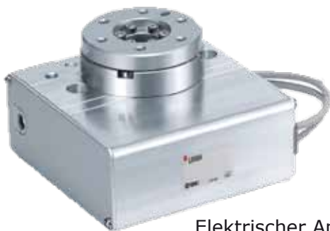
Elektrischer Antrieb/ Miniaturausführung Serie LEP