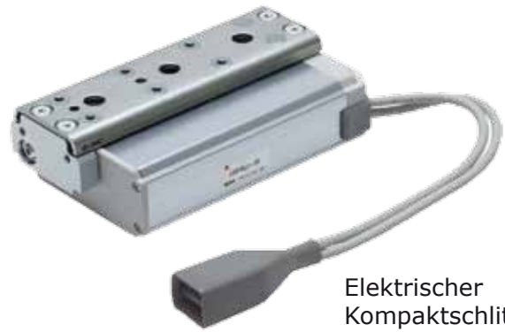
Elektrischer Kompaktschlitten Serie LES