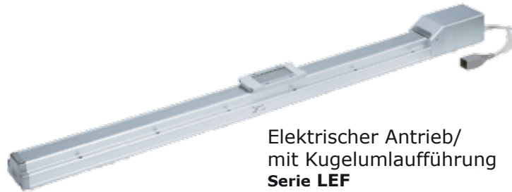
Elektrischer Antrieb/ mit Kugelumlaufführung Serie LEF