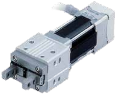
Elektrischer Greifer Serie LEH